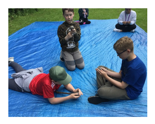
Forest School Fun for Year 4 and 6